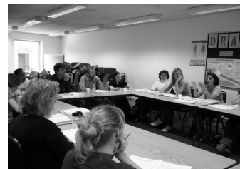
LDAN meeting in June 2007