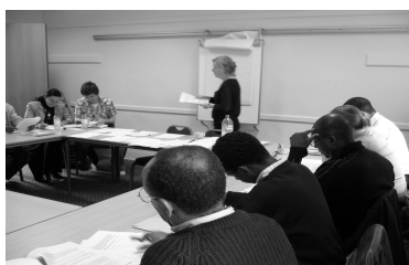
Photos from our past training sessions in London

ASAP are delighted to extend our successful asylum support law training to regional areas outside London for the first time. This time, we are visiting Bradford and Hull. We are very grateful to the Allen Lane Foundation for supporting this extremely valuable work and we hope to meet as many Refugee Community Organisations and other advice agencies working with refused asylum seekers in these areas.