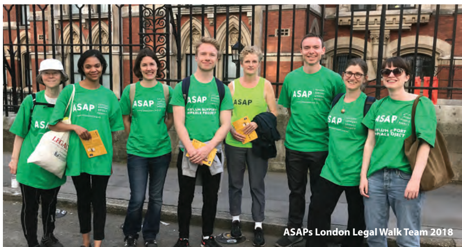
ASAPs London Legal Walk Team 2018