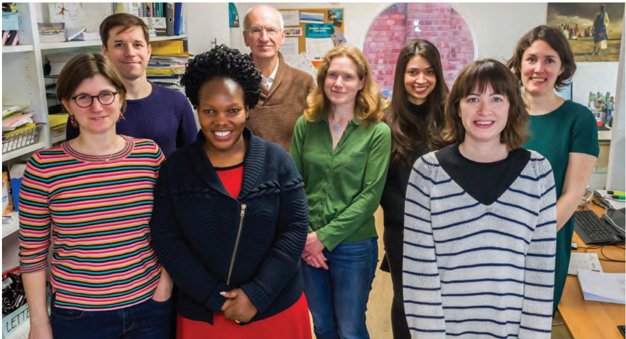
The current ASAP team